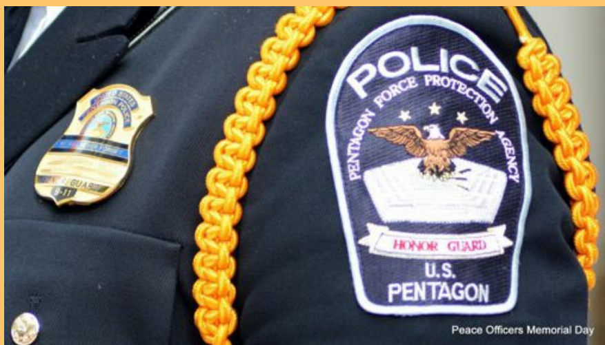
Peace Officers Memorial Day