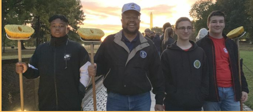
Eagle Chairman with Boy Scout Troop 1778 Members at the Vietnam War Veteran Memorial Wall

Look who surprised me by appearing at the Vietnam Security Police Association Wall Wash last month! VSPA added one more wall wash to our schedule during their week-end annual banquet in Washington DC. Though I didn't reach out to the Boy Scout, they appeared and as always we are always delighted to have them aboard. Thanks guys. See you again next year.