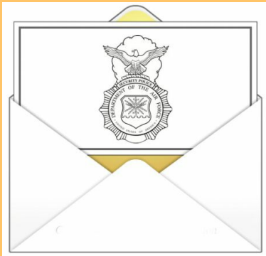
52d Maisey Wreath Laying