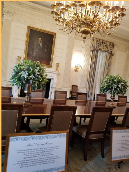
White House State Dining Room